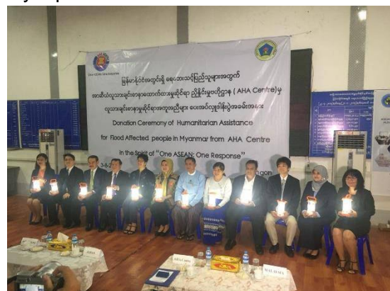
Handover ceremony of ASEAN relief items to the DDM