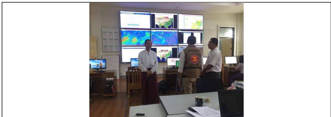
AHA Centre ICLT provided assistance and coordination at Department of Disaster Management Emergency Operation Centre