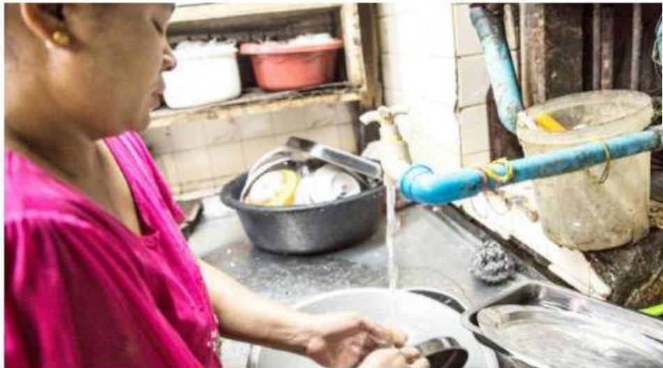
Supply, distribution of water in Yangon to be privatized: Mayor